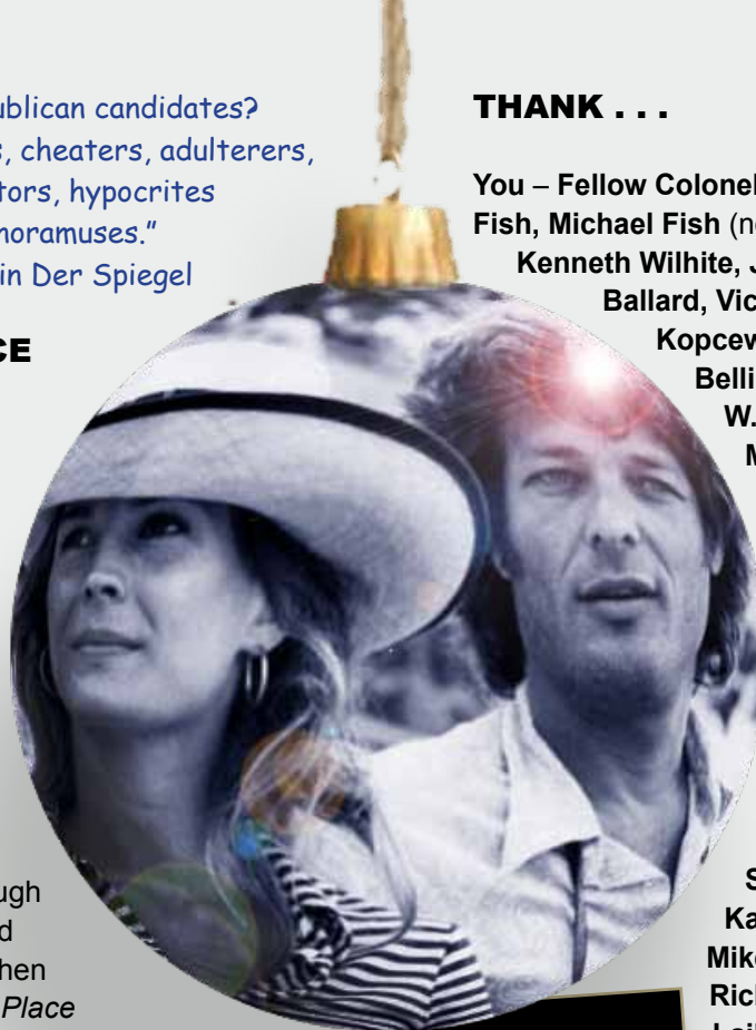
BERT AND BERGEN. Farewell to Bert Schneider, pictured here with Candice Bergen in 1972.

"Peace cannot be kept by force; it can only be achieved by understanding." ~ Albert Einstein